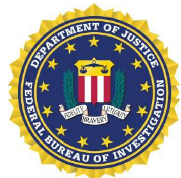
Special Agent Active Field Agent FBI