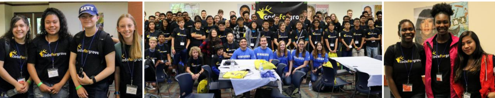
* taken at CodeForGrove, another cyber security boot camp by Yellow Circle Inc, held on June 2-3, 2018 at Cosumnes River College, Sacramento, CA

The goal of CodeForFolsom is to increase interest in cyber security careers, and increase diversity in cyber security workforce, ensuring that enough young people are inspired to direct their talents in this area. Cyber Security is critical to the future of our country's national, economic, and physical security. This cyber security boot camp provides students with 10+ hours of training, along with breakfast, lunch, snacks, awards, giveaways, prizes and more.