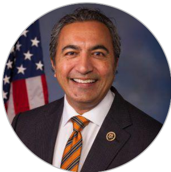
Congressman Ami Bera US House of Representatives